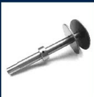
SHAFTS & DISCS